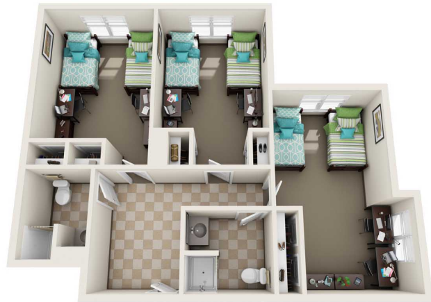
Renderings are an artist's conception and are intended only as a general reference. Features, materials, finishes and layout of subject unit may be different than shown. 3DPlans.com

Some students will be housed in what's known as a "4 x 1." This means a dorm with two bedrooms (two beds apiece), connected by a shared bathroom. Which is good news ... no walking down the hall in your flip-flops!