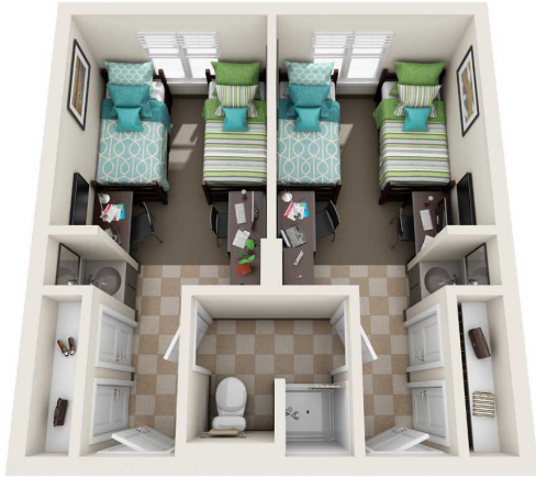
Renderings are an artist's conception and are intended only as a general reference. Features, materials, finishes and layout of subject unit may be different than shown. 3DPlans.com

Some students will be housed in what's known as a "4 x 1." This means a dorm with two bedrooms (two beds apiece), connected by a shared bathroom. Which is good news ... no walking down the hall in your flip-flops!